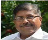
Hon. Chandrakant Dada Patil President